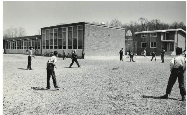
A Ball Game in Front of OLM

Parent Councils have been asked by the Algonquin & Lakeshore Catholic District School Board to help compile a history of the schools. We are reaching out to the community to help us gather old photos, news articles or fun memories from past students. We would really like to showcase how wonderful our school is! Any help would be greatly appreciated You can email flhpomer@alcdsb.on.ca or drop off any info at the school office. Thank you